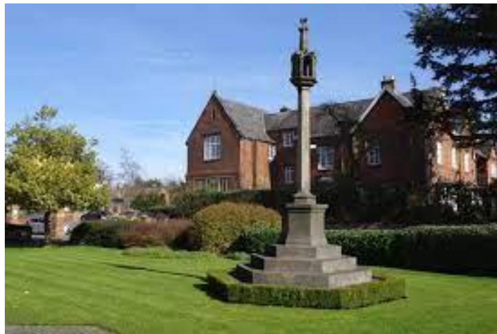
Rugby School War Memorial – grade II listed.