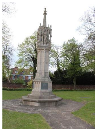
War Memorial in the Churchyard of the Church of St Wulfram, Grantham, Lincolnshire LEN 1062502, Grade II*